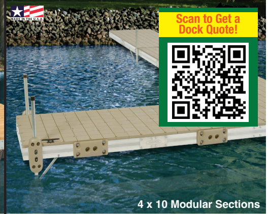
4 x 10 Modular Sections