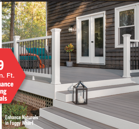
Enhance Naturals in Foggy Wharf