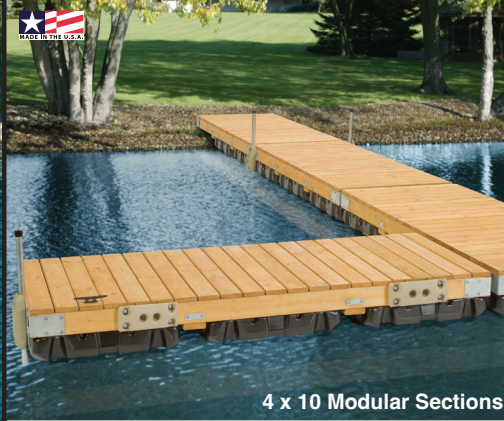
4 x 10 Modular Sections