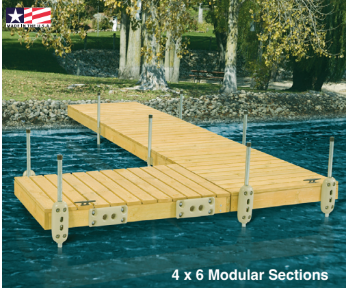
4 x 6 Modular Sections

All Portside® Docks provide the best quality and most value by allowing you to easily create a beautiful shoreline your family and friends will enjoy for many years. Portside® Docks are made from modular sections which can be easily configured to meet any requirement. Choose from our 6 pre-designed recommendations or create your own. Treated Wood, Resin and Composite tops available. The docks are designed to accommodate seasonal changes in water level or complete removal from the lake.