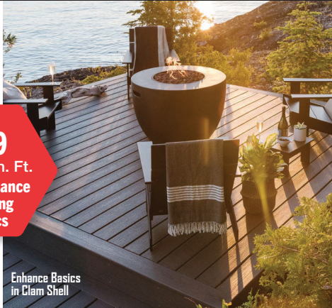
Enhance Basics in Clam Shell