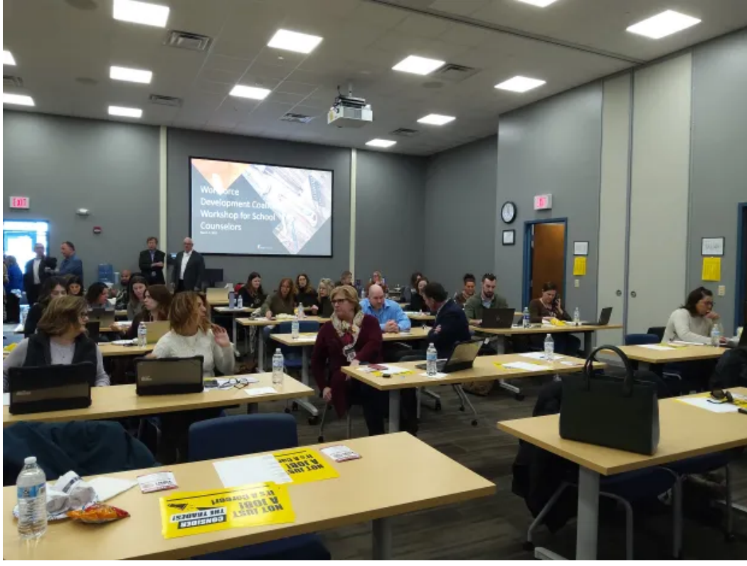
Dozens of school counselors attended the workshop hosted by the Capital Region Workforce Development Coalition and WSWHE BOCES.