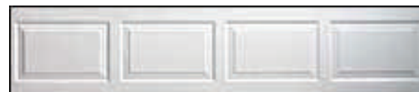
Classic Raised Panel

Classic panels -Short panels also add depth to the door while adding beauty to your home's exterior. The classic style is the most common design and compliments the largest variety of home styles.