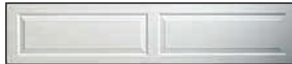
Ranch Raised Panel

Ranch panels -Long slim panels give depth to the door while adding beauty to your home's exterior.